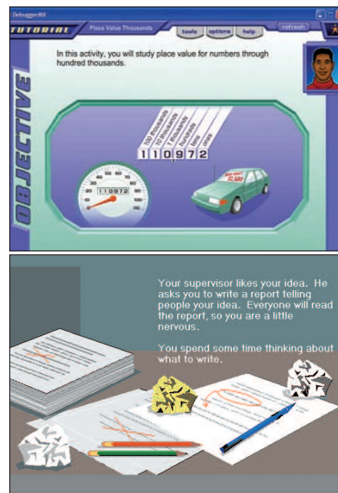
PLATO® Foundational Mathematics and PLATO® Writing Process and Practice are two of PLATO Learning's newest offerings in developmental education.

You may also choose from one or more of our stand-alone developmental education products—PLATO® Interactive Mathematics, PLATO® Interactive English, or PLATO® academic.com.